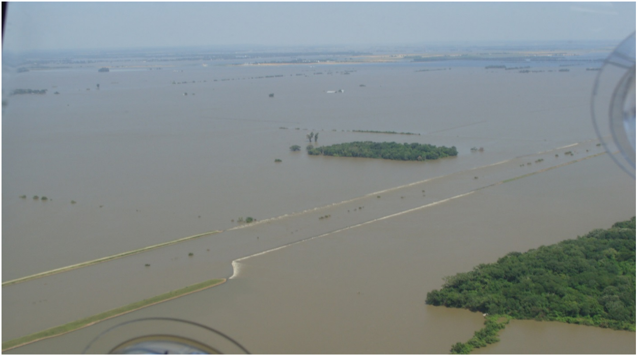
288. Below is a true and accurate photograph taken on June 15, 2011, of a farm located near Blair, Nebraska.